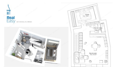
Apartamento T1 em Tavira - Refª RE143 www.realeasy.pt